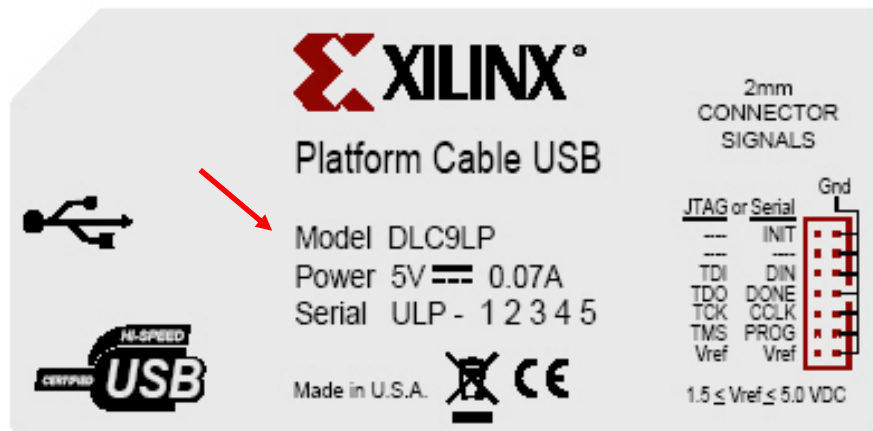
Figure 1. Example of a Label on a Low Power Cable